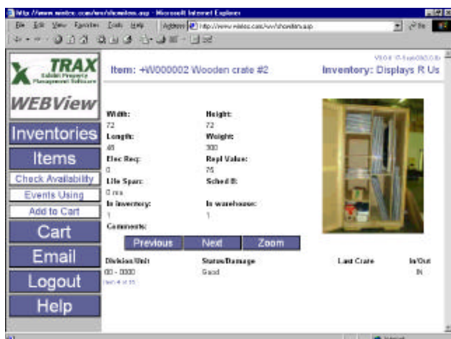
Client's web browser